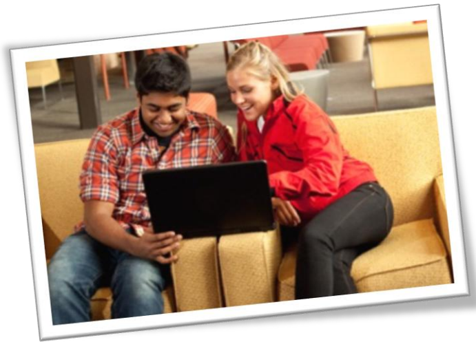
Caption 2 style is used to add picture captions. Captions are in text boxes for easy placement relative to images.