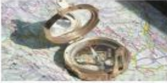
Chart Your C.O.U.R.S.E.

1 st Virtual Leadership Meeting July 25, 2020 9am – 12 pm California Council of IAIP