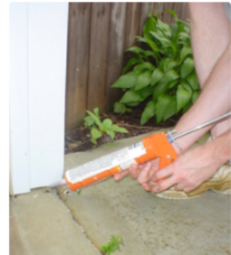
Sealing holes on the exterior of a house.