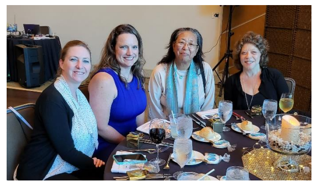
Attendees from SBAIP to Ca Council Meeting